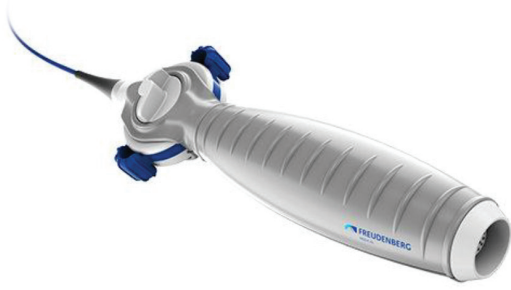
Figure 2 Freudenberg Medical – Commercialization ready handle for EP

At Freudenberg Medical, we are focused on being at the cutting edge of innovation, working together with our customers to realize their innovations, through adding expertise in technology advancements, manufacturing know-how and services. Some offerings include a huge level of experience in development and manufacture of complex composite shafts, including braid, coils, electronics, fibres, steerability and various other integrations. We also have some commercialization ready technologies that can be utilized or adapted by our product design team for your application. Get in touch to speak with some of our team to see if we can work together.